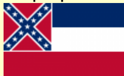
Mississippi State Flag